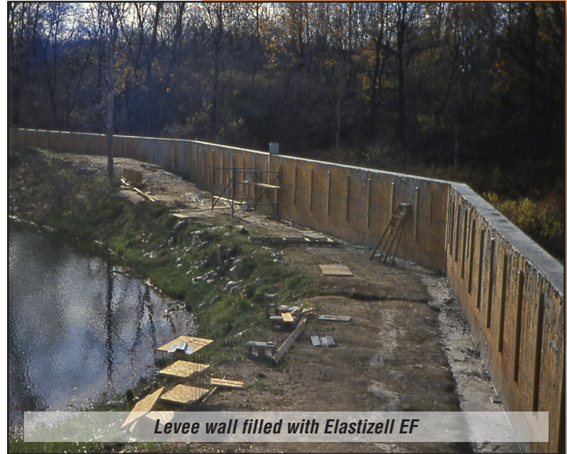
Levee wall filled with Elastizell EF