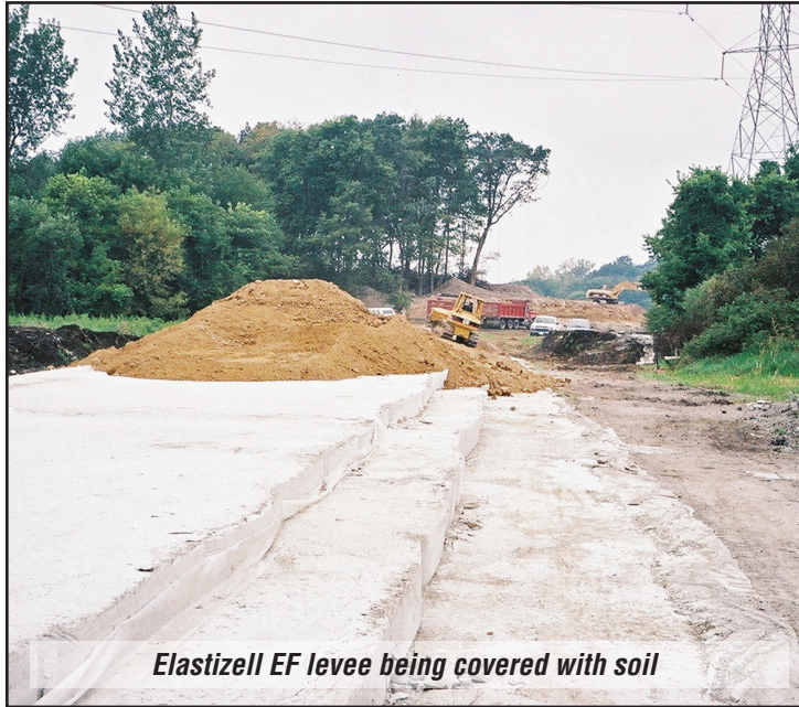
Elastizell EF levee being covered with soil